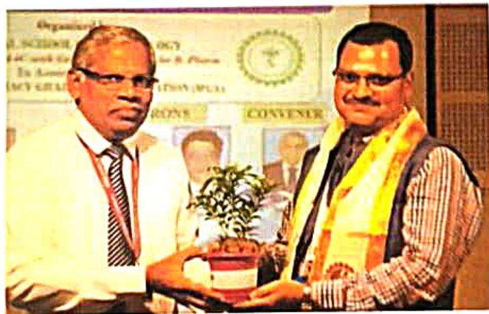
Seminar on "INNOVATIONS IN PACKAGING OF PHARMACEUTICAL FORMULATIONS"