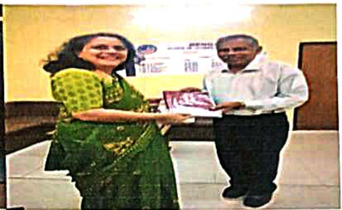
Women's Day Celebration (2024)