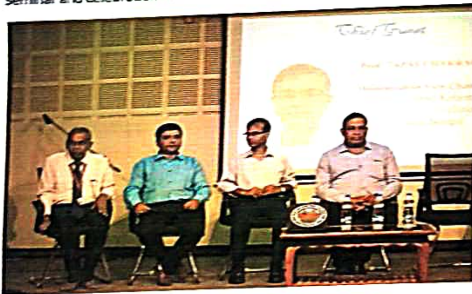
Seminar and Celebration of "LIVING WITH AI: UNDERSTANDING ITS ROLE IN MODERN LIVING"