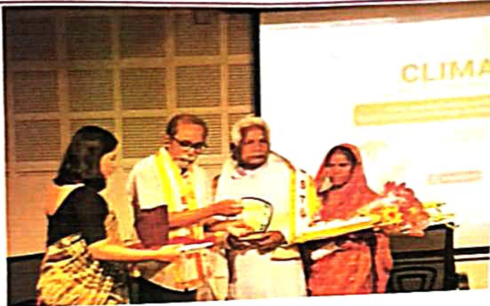
Seminar and Celebration of "CLIMATE 24- NAVIGATING THE CLIMATE CRISIS"