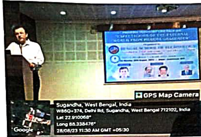
Seminar on "EXPECTATIONS OF THE EXTERNAL WORLD FROM PHARMA GRADUATES"

Sugandha, Delhi Road, Near Chinsurah Railway Station, Dist: Hooghly-712 102, West Bengal