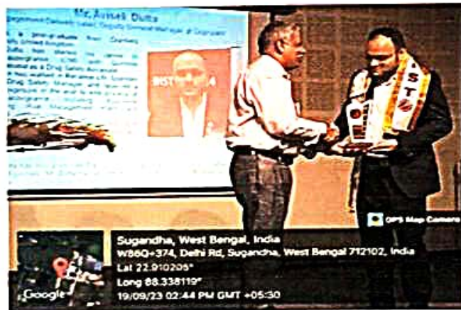
Seminar on "BOOSTING PUBLIC CONFIDENCE IN PHARMACOVIGILANCE"