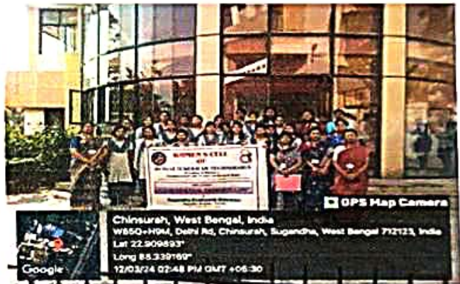
Environmental Awareness Camp organized by women's cell in a nearby school (12.03.2024)